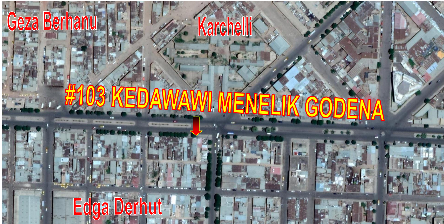
MAP #1 : Location of the Big House on Kedamawi Menelik Godena (ቀዳማዊ ምኒልክ ጎደና).