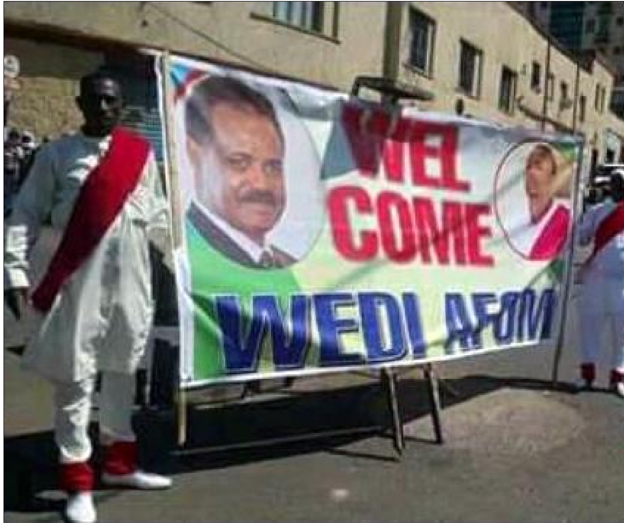
#5 Novices of Amhara Kelel are goldmines for BADO-5.