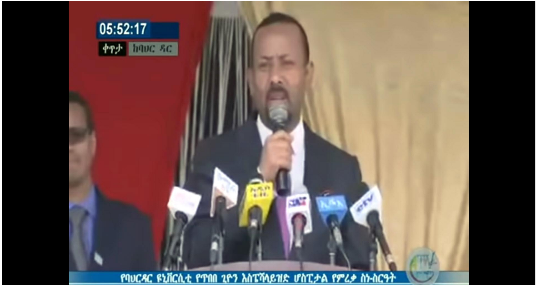
#4 Abiy Ahmed delivering BADO-5 hoax, “Gondar is the burial ground of Isayas’s grandfather.”