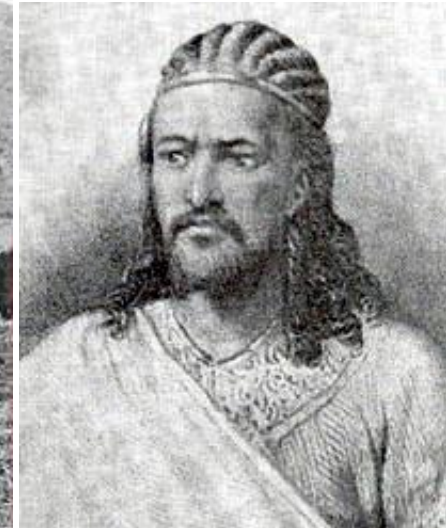
#10 In 1886 British Expeditionary Force posed to attack the army of Tewodros II (አባ ታጠኝ), King of Ethiopia.

On April 1868, Field Marshal Robert Napier attacked Fort Maqdala. It was inevitable, the superior British Force easily routed Tewodros's mostly rag tag army. In the fight Tewedros quickly realized that defeat was imminent as his army was completely overwhelmed by the