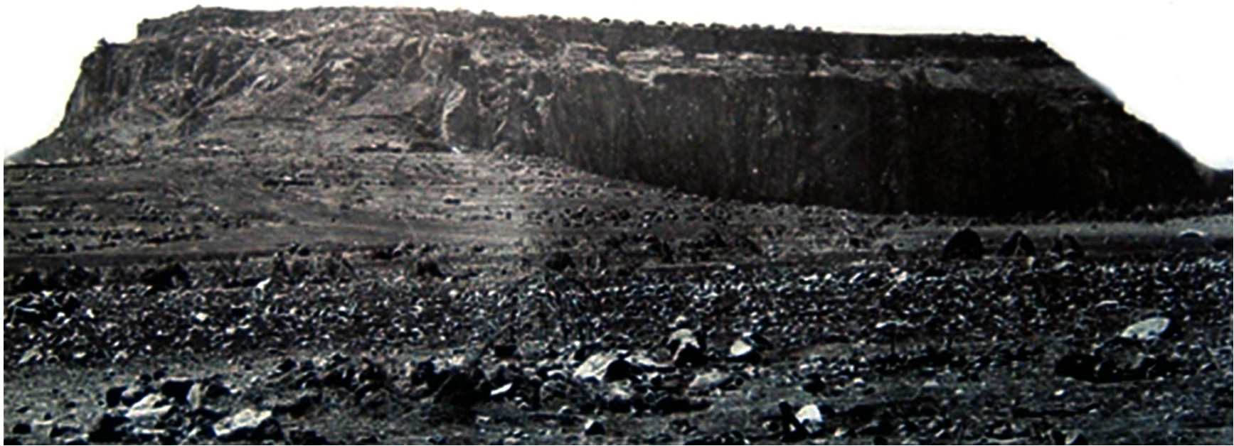
#8 The mighty fortress, Fort Maqdala, Wollo

To avenge the actions of Tewodros, Great Britain assembled huge Expeditionary Force from India to invade Ethiopia and attack Aba Tateq's army, under Field Marshal Robert Napier.