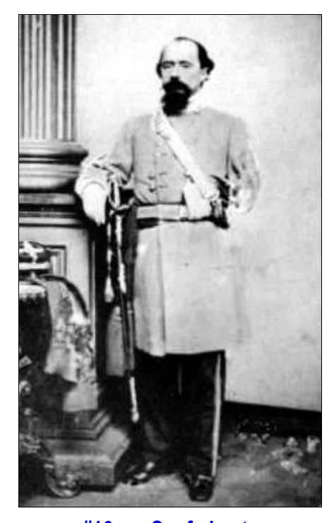
#16 <u>ex-Confederate</u> General William Wing Loring

Yohannes's army won an decisive victory over the Egyptian force. They killed scores of Egyptian soldiers and they captured hundreds of prisoners. They captured quantities of arms.